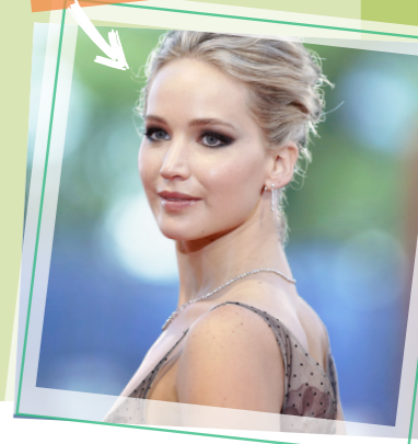
Jennifer Lawrence is the youngest in her family