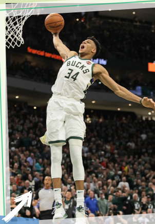
Giannis Antetokounmpo is a middle child