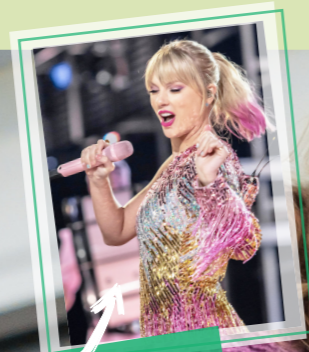
Taylor Swift is a successful oldest child!