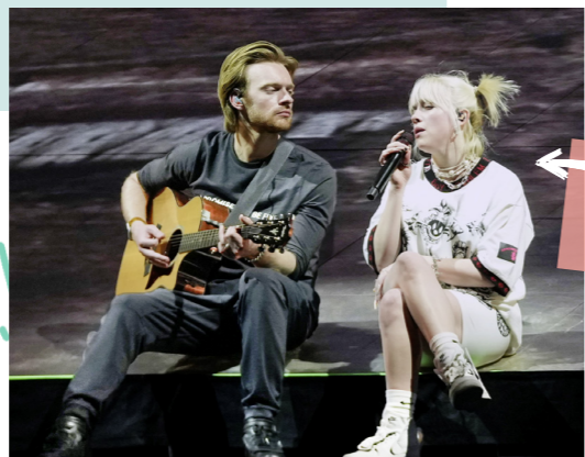
Finneas performs with Billie!

In my Opinion Do you think it's a good idea to work with a sibling or close relative? Why? See Teacher's Guide for possible answer.