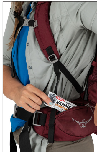
ZIPPERED HIPBELT POCKETS 45L / 65L

Removable sleeping pad straps allow for quick, secure external gear attachment