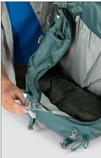
SLEEPING BAG COMPARTMENT 65L

Lower zippered compartment for dedicated sleeping bag storage with detachable divider for unimpeded access to pack interior.