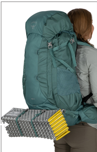
SLEEPING PAD STRAPS 45L / 65L

Lower zippered compartment for dedicated sleeping bag storage with detachable divider for unimpeded access to pack interior.