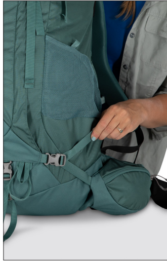
DUAL UPPER AND LOWER SIDE COMPRESSION STRAPS 45L / 65L

Front panel cord loops for rigging gear to pack or attaching an Osprey Daylite®.