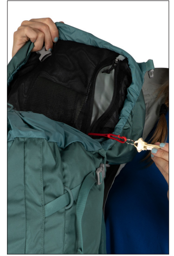
FLOATING TOPLID WITH POCKET 65L